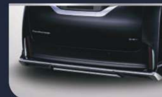
Rear Skirt Modellista**

*Available for Toyota All New Alphard All Type.