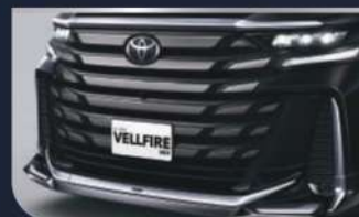
Front Skirt Modellista**