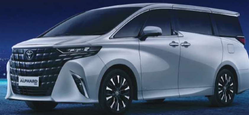
2.5 HEV Type

Experience sophisticated feeling in every path with Toyota All New Alphard HEV and bring sustainable impact for environment.