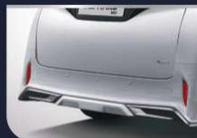
Rear Skirt Modellista*