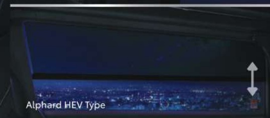
Alphard HEV Type

Experience convenience throughout every journey on Captain Seat (All Type) supported Detachable Smartphone-like Remote Control (All HEV Type) for private ambience and adjustable Rear Side Shade. (All Type)