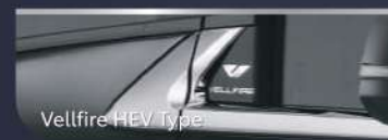
Vellfire HEV Type

Bring out the bold look to the surroundings in all ways.