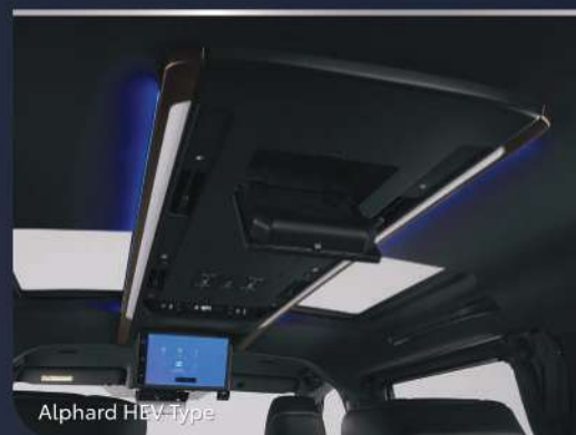
Alphard HEV Type

The luxurious design and advance features including Steering Wheel, MID, Head Unit Display (G & All HEV Type), and DVR (G & All HEV Type) to satisfy you in every drive.