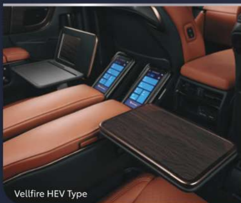
Vellfire HEV Type

Create a sense of ambience through the classy Interior Design, including the Steering Wheel, 12.3" TFT MID, 14" Head Unit Display, and Wireless Charger.