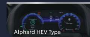
Alphard HEV Type

Provide an extra Front Seat Storage to accommodate your needs. (All Type)