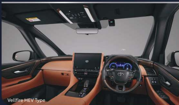
Vellfire HEV Type

Discover elegant ways to enhance your environmental contribution and enjoy a luxurious experience by exploring numerous new paths with Toyota All New Vellfire HEV.