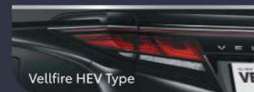
Vellfire HEV Type

The Vellfire emblem detail are designed to strengthen the extravagance look on every journey.