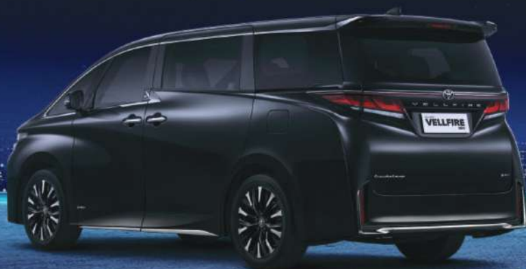
Vellfire 2.5 HEV Type