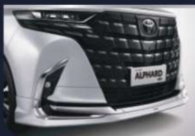
Front Skirt Modellista*

*Image shown are for illustration purpose only.