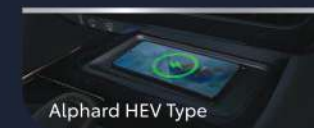
Alphard HEV Type

An entire digital display to serve all essential information about your vehicle. (All Type)