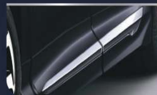
Side Skirt Modellista**