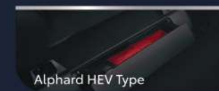
Alphard HEV Type

Indulge you in every journey with entertainment through bigger head unit. (All Type)