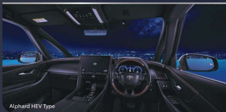
Alphard HEV Type