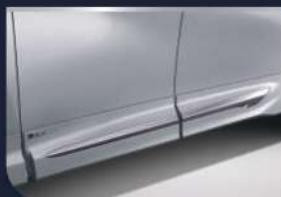
Side Skirt Modellista*