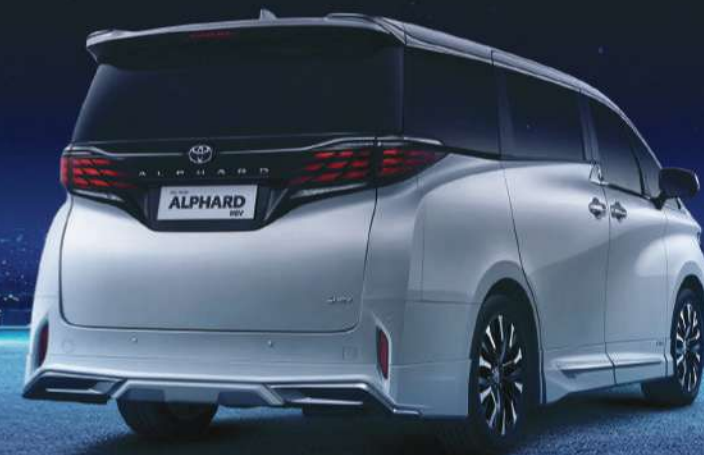
2.5 HEV Type*