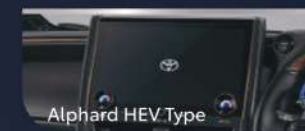
Alphard HEV Type

Comes with Interior Lighting, Ceiling Storage, and 14" Rear Seat Entertainment to provide you with ease along the journey. (All Type)