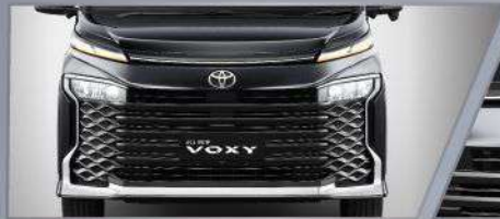
NEW RESILIENT FRONT BUMPER AND INTRIGUING GRILLE DESIGN

A well crafted exterior that enhanced the visual sense and energetic feeling.