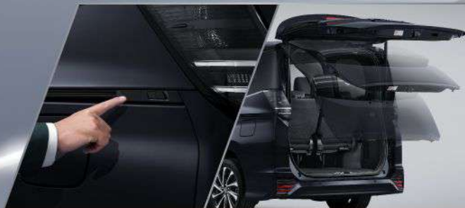
NEW DASHING POWER BACK DOOR WITH SIDE BUTTON

A motion sensor below the power sliding door, enables the door slides as simple as swipe with the foot.