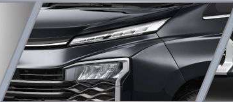
NEW BOLD HEADLAMP DESIGN

Crafted to represent your exquisite and radiant personality.