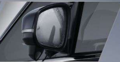
NEW OUTER MIRROR WITH HEATER FUNCTION

More than just a combination, yet picturesque illuminations that keep driving backward trouble-free.