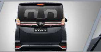
NEW STYLISH REAR COMBINATION LAMP

Strong yet striking design that complete the appearance.