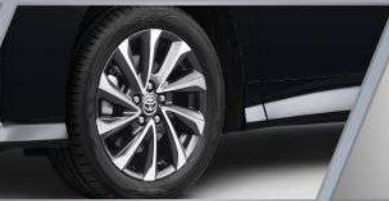
NEW STUNNING 17" DISC WHEEL

Detail-oriented design that makes a captivating overall looks.