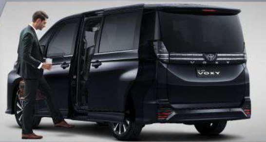
DUAL SLIDING DOOR WITH NEW KICK SENSOR

Smart and easy way to provide convenient entrance.