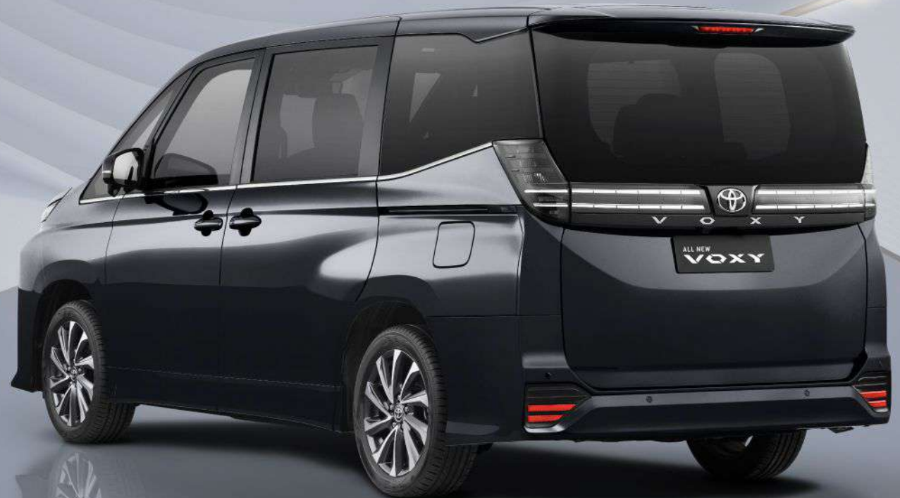
MAJESTIC REAR DESIGN

A simple touch on the side button of the power back door helps you to adjust the opening angle even if there's obstacles around.